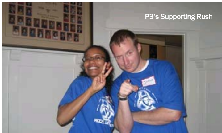
P3's Supporting Rush