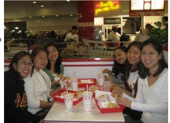
Brothers Having a good time at In and Out Rush Event

pharmacy students and never let us down. They displayed goofiness to no end, showing us first years a good time. I loved it so much I pledged to the fraternity and now will continue the RUSH!