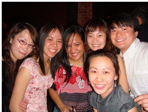
Pledges Having Fun at the Club Roe

brothers moving from group to group, from one side to the other, and most importantly amongst each other. If we weren't bonded already, this definitely did the trick! It was a great night, and a great start to the pledge events. After a very late night of drinking, dancing, and bonding, the pledges were heading home and thinking: