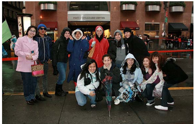
Pledges at Chinese New Year's Parade in Downtown San Francisco

was February in San Francisco. But despite the cold and gloom, I will always have warm memories of our pledge class trip and our journey to being Phi Delta Chi brothers.