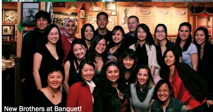
New Brothers at Banquet!