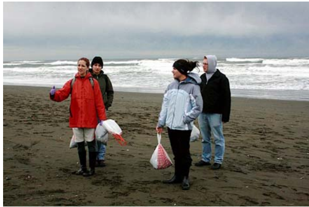
Pledges Freezing on the Beach for a Good Cause.

little cleaner that day, but we demonstrated our commitment to service and to each other. While I know that the obstacles that we will face will far exceed a little rain and wind, it is reassuring to know that as I go on through pharmacy school,