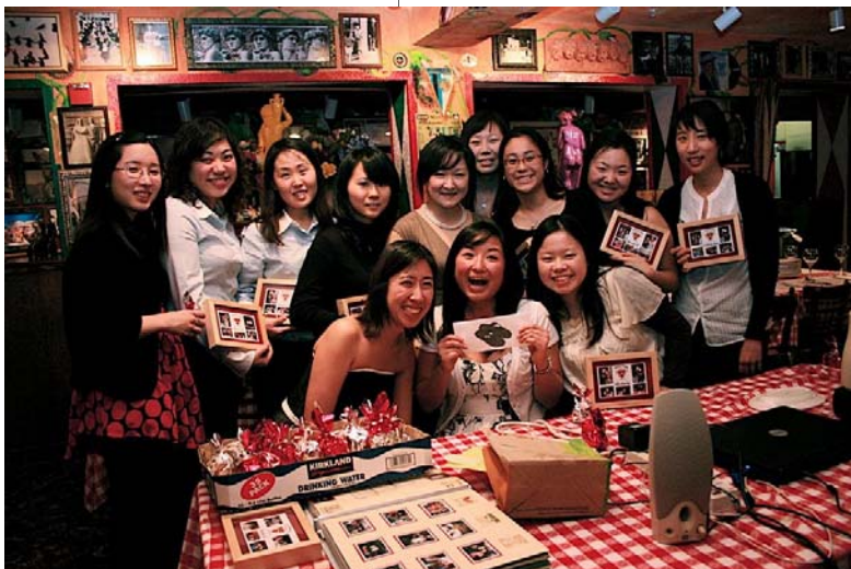
The 2007-2008 PDC Cabinet Posing for a Final Picture at Banquet

As spring quarter comes to a close and summer rolls in I hope to see everyone energized and excited for the next year. First years, it's your time to step up and shine. Second years, you're half over and 2 quarters from rotations. Don't forget about your fellow brothers, as there is ALWAYS time to play. Third years, we have missed your presence already and the same goes out to you, there is ALWAYS time to play. To all brothers we can do this, we can face our obstacles head on and thrive. AAAE!