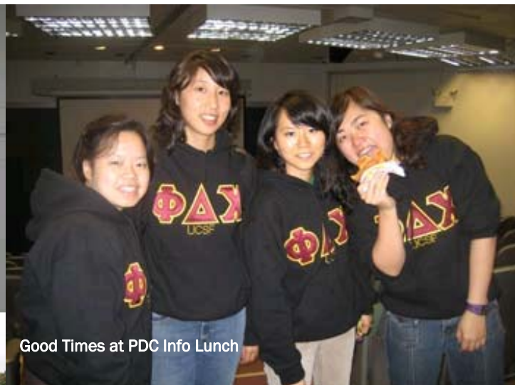
Good Times at PDC Info Lunch