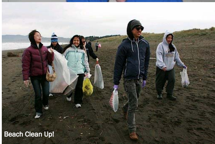
Beach Clean Up!