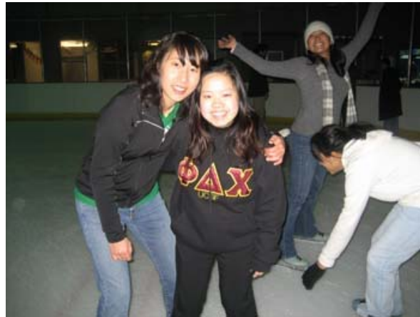
Cooling Down After Midterms With PDC at Ice Skating Event!

All jokes aside, we are so grateful for the experiences and memories we have had as the PDC Rush Coordinators. There were endless hours spent on planning, setting up, and advertising for the various fall Rush events. Our main goal was to get the first-years and fellow brothers psyched for a good time. We genuinely wanted to get to know the P1s and hoped to make them feel welcome in their new home, UCSF. This was achieved through many