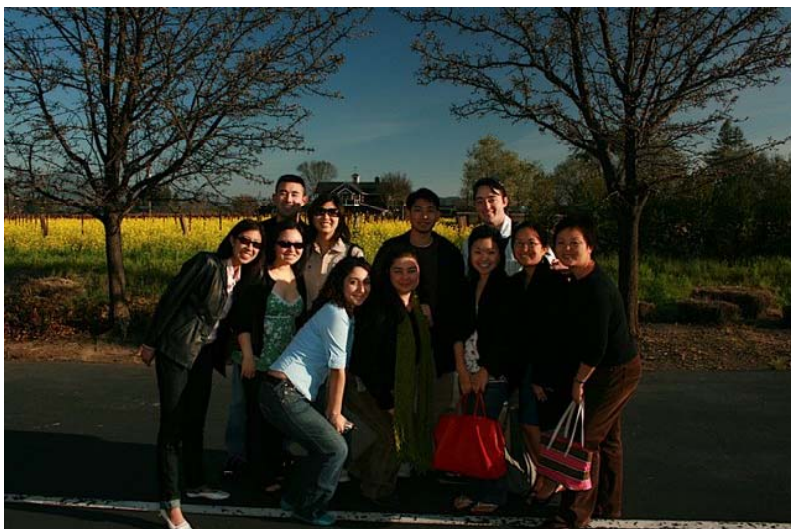
2008 Napa Wine Tasting Trip

"The warm, genuine and encouraging interactions had confirmed that I had made the right choice when deciding to pledge."