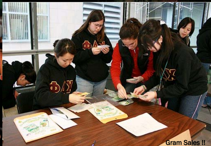
Gram Sales !!