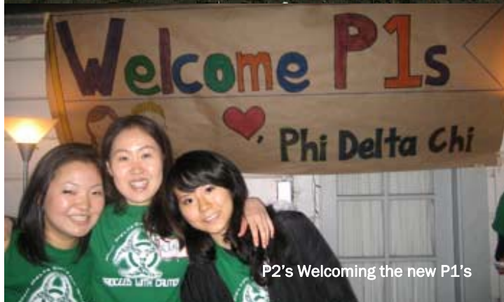
P2's Welcoming the new P1's