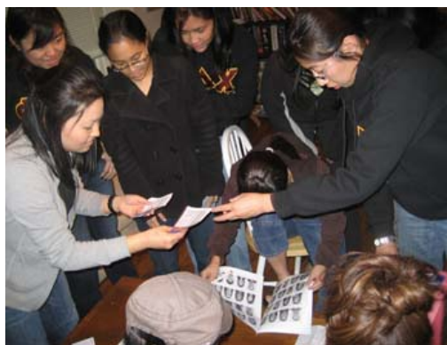
Opening Pledge Card Box and Revealing New Pledges!

pledges battle brothers during scavenger hunt, the happy expressions once pledges become brothers, "studying" on the second floor of the library, traveling thousands of miles to Grand Council, opening the pledge card box, wearing the PDC sweatshirt