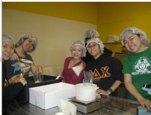
Volunteering at San Francisco Food Bank.

“I was always touched to see so many volunteers working together to share the love with those who are less fortunate.”